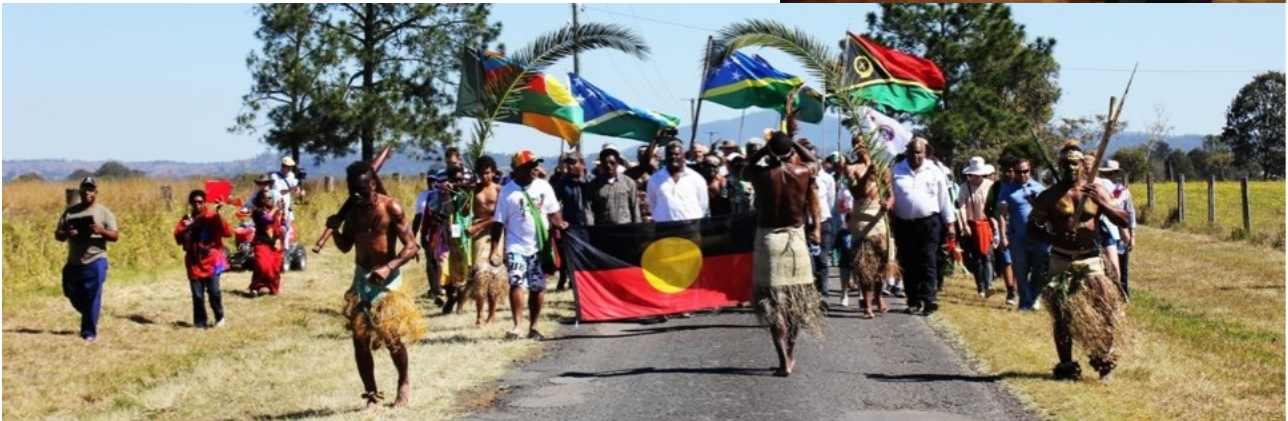
2013 included the following main activities:

Commemorative walk along Walker Road into the grounds of the church. The walk reflected the original walk of the Islanders as they made their way onto the plantation land 150 years earlier. However this time the ASSI people and dignitaries from Vanuatu walked together as equals with the descendants of the original landowners and were welcomed onto their land by the Traditional Custodians of the Land, the Mununjali People.