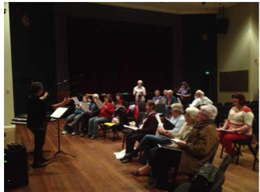
The community commemoration day on the 24 August